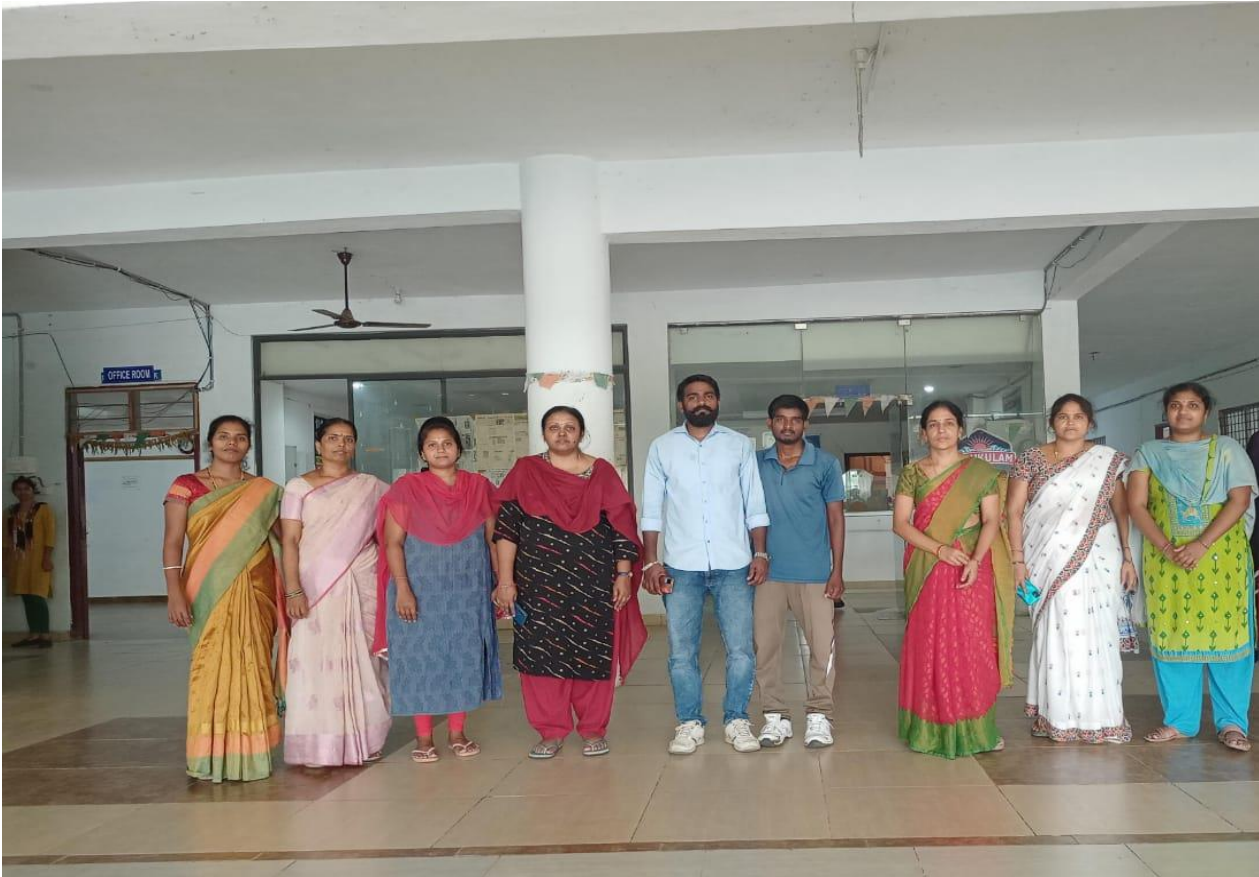
NGO Of Man of Social responsibility for peoples Defence and Principal and other staff after martial arts meeting . All together 45 students trained till date in our institution under this academy.