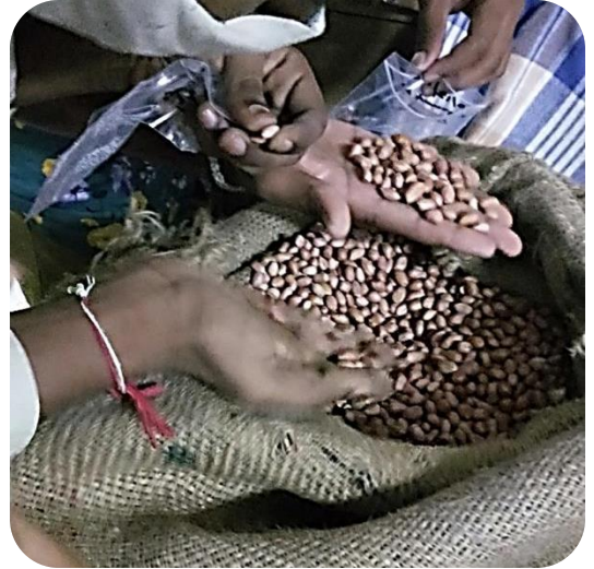
Students collecting groundnut samples from college mess store