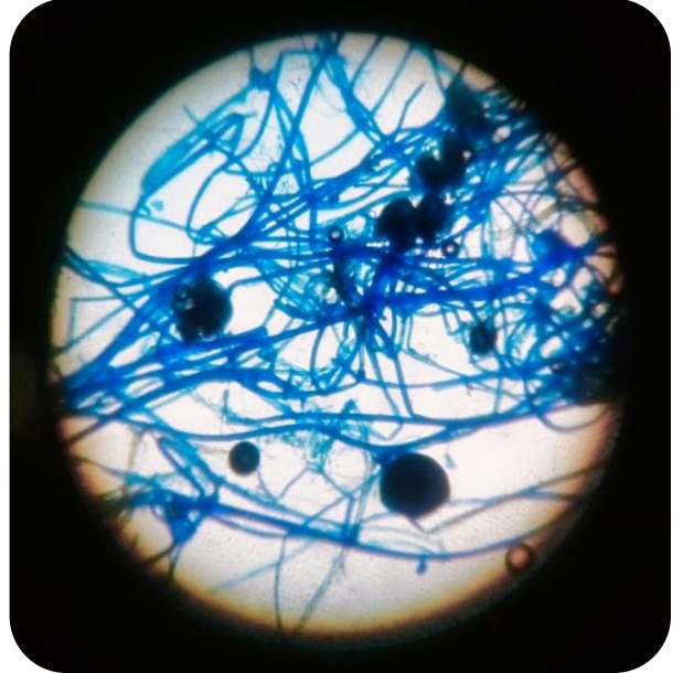
Fungal mycelium slides