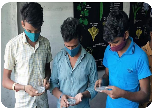
Observation of plates