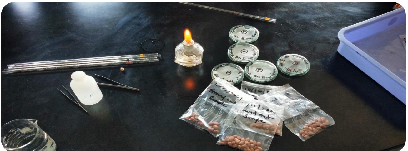
Preparations for isolation of fungi from groundnut samples