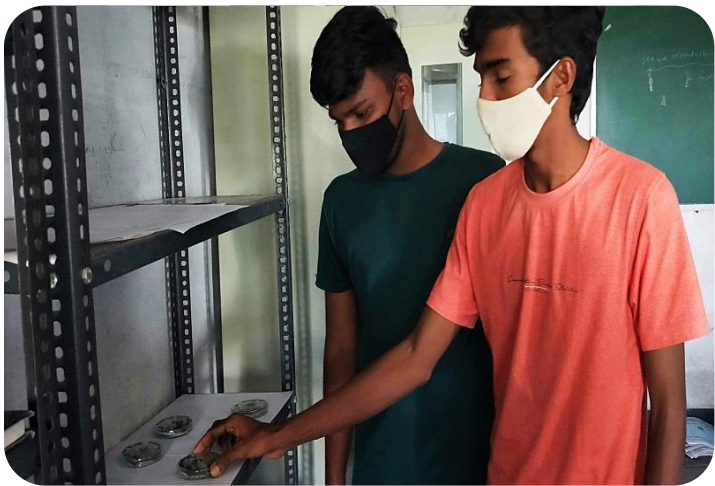
Keeping ground nut samples in petri dishes for incubation