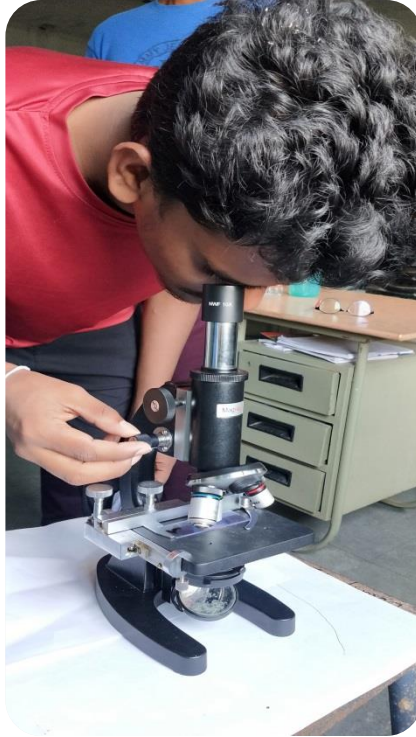
Preparation and observation of fungal slides