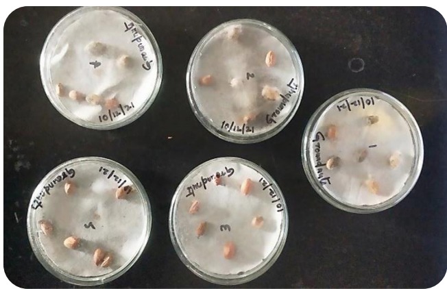
Petri plates showing mycelium