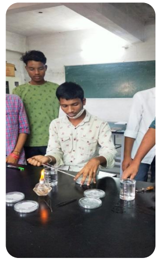
Keeping ground nut samples in petri dishes for isolation of fungi