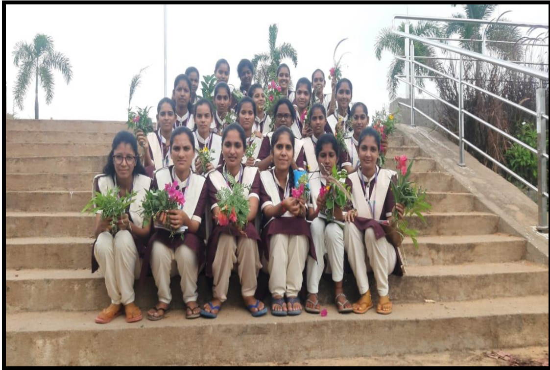
Field trip for Specimen Collection for Herbarium