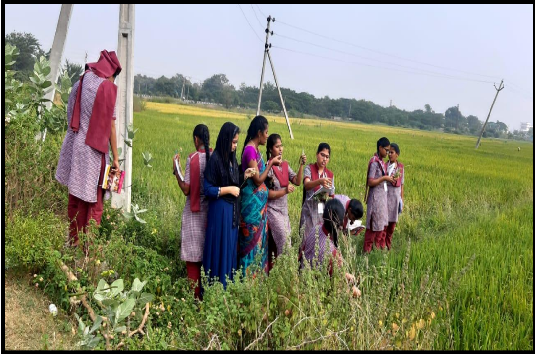
Collection of Plant Specimens for Herbarium