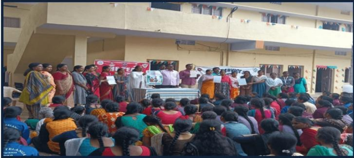
Poster presentation of Girl child