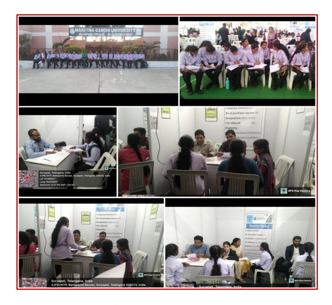
Students attending interviews