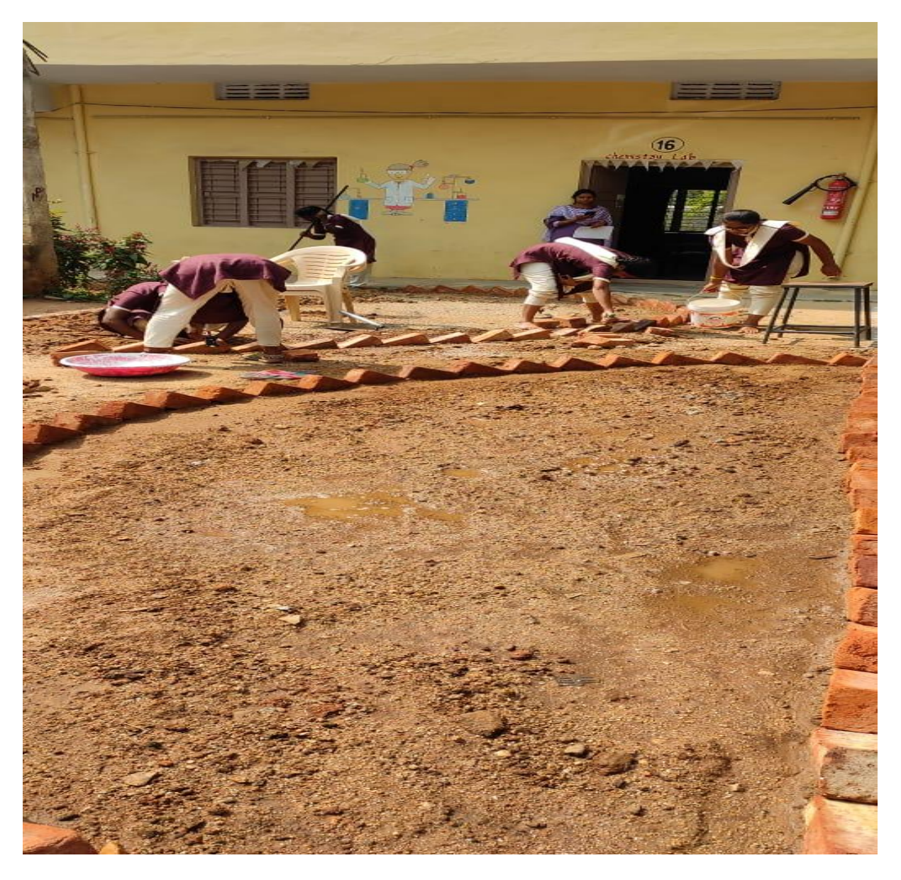
Made by happy benches